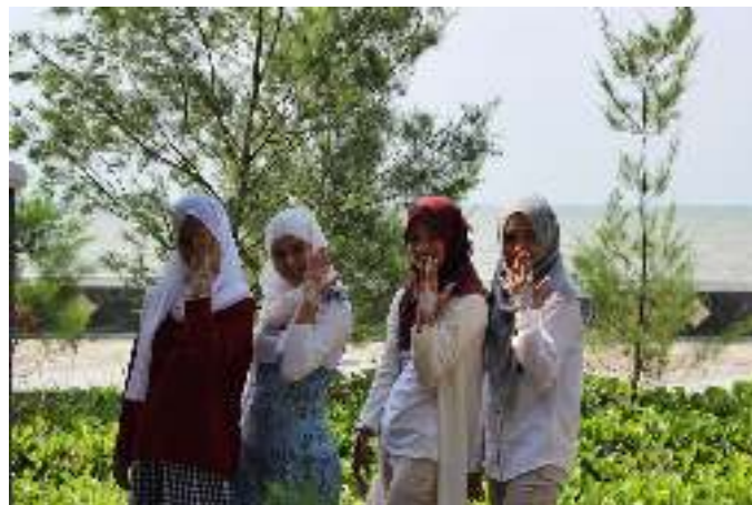
Visiting Pantai Alam Indah Tegal and having henna