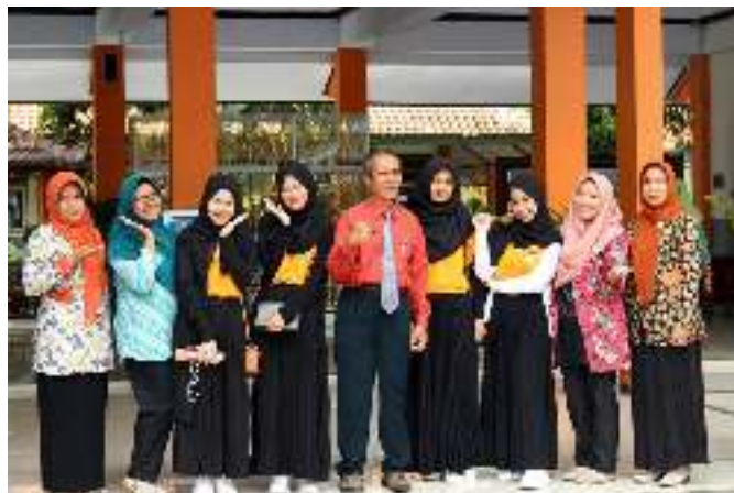
School Visit at SMA N 2 Pemalang