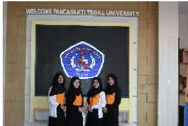
In the lobby of the rector's building