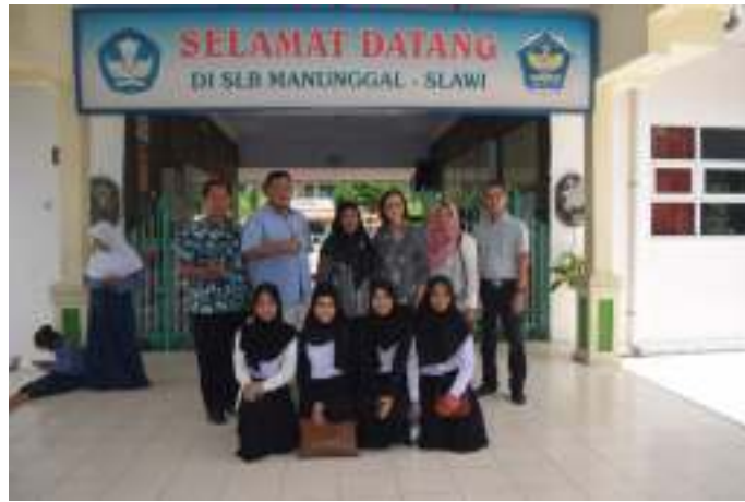
School Visit at SLB Manunggal Slawi