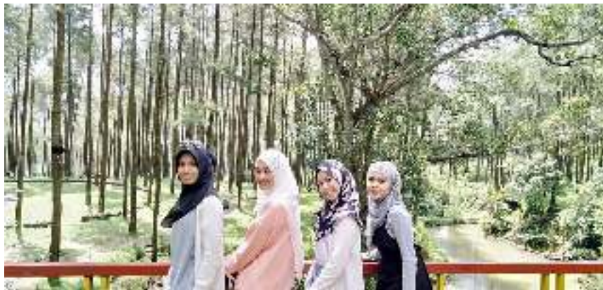
Visiting Prabanlintang pine forest