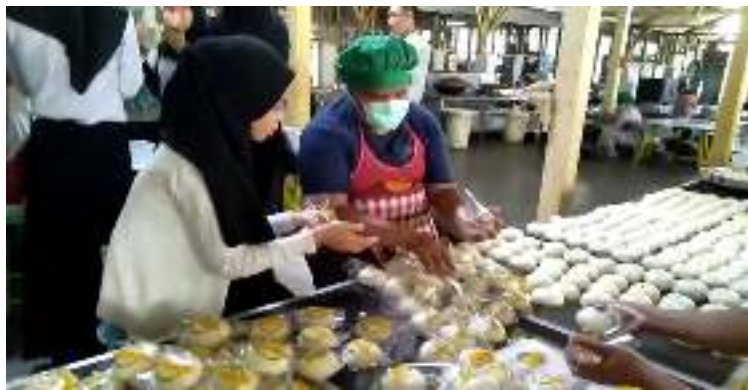
Company Visit: Ria Cake & Bakery