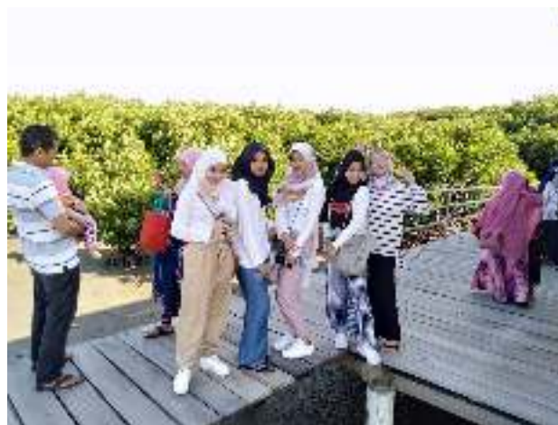
Visiting Pandansari mangrove forest