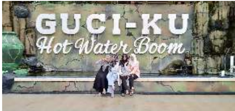
Visiting Guciku Hot Water Boom