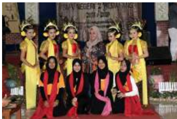
Learning a traditional dance at SMA N 2 Pemalang