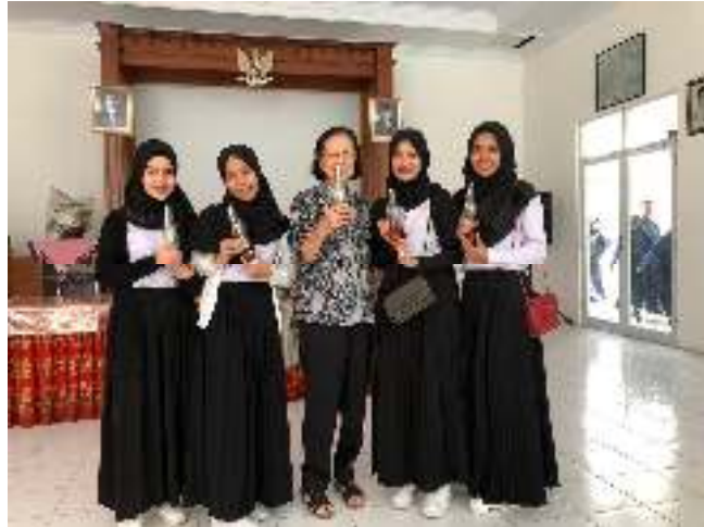
Company Visit: Teh Botol Sosro